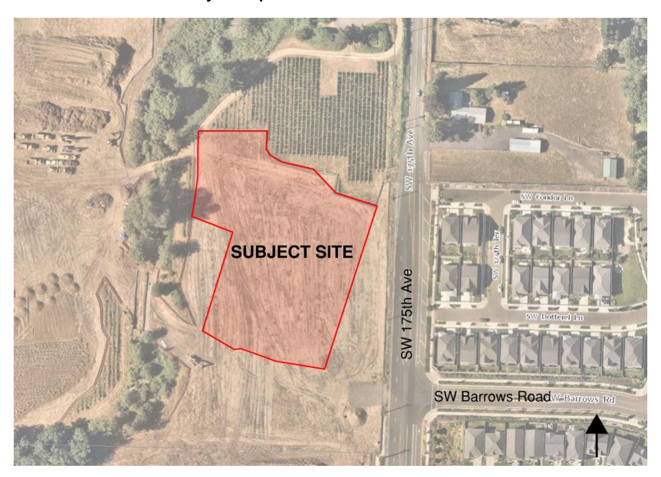
Exhibit 1.1 Vicinity Map